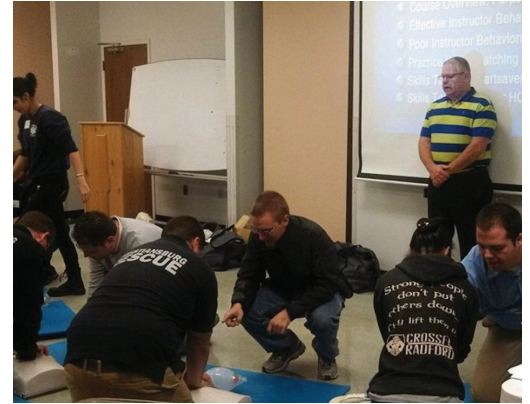
CPR training in Christiansburg.