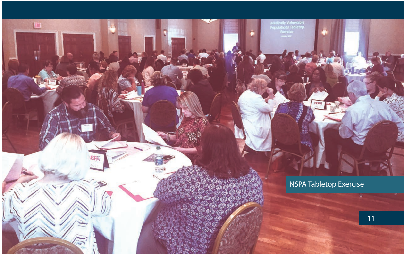
NSPA Tabletop Exercise

In conjunction with NSPA, offered ADLS and BDLS courses